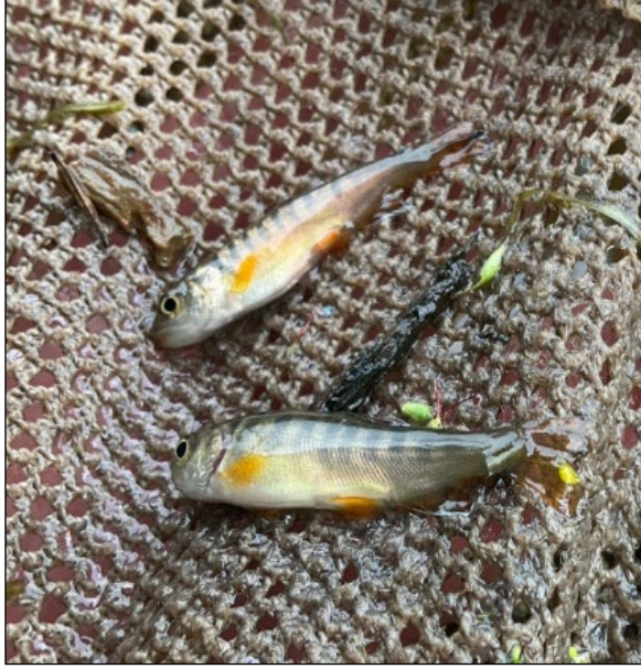
Figure 1.—Juvenile coho salmon caught at waypoint 753.