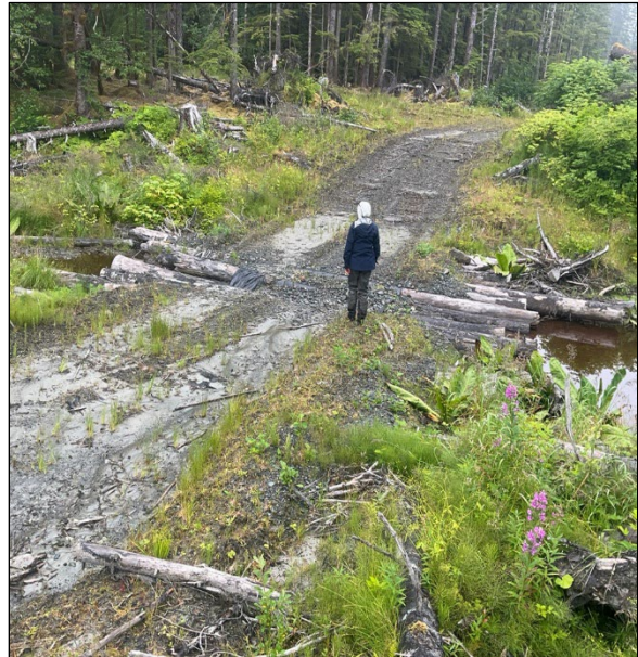
Figure 4.—Puncheon bridge at waypoint 761.