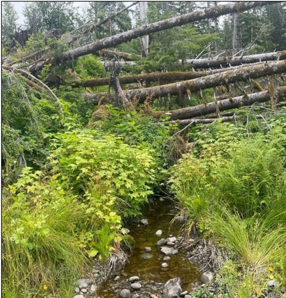
Figure 3.—Buffer blown into the stream channel at waypoint 755.