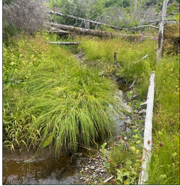
Figure 2.—Looking upstream at waypoint 753.